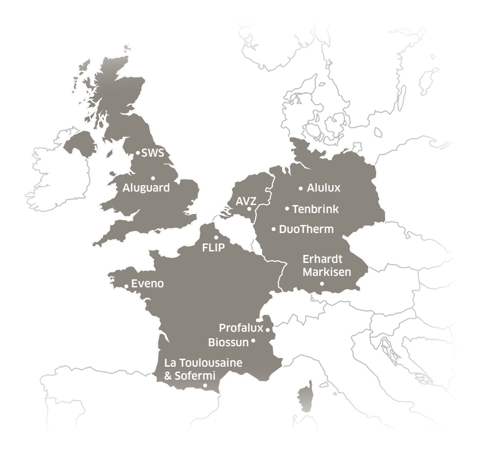
European locations, worldwide market

Let our customers benefit from the strength of an international group